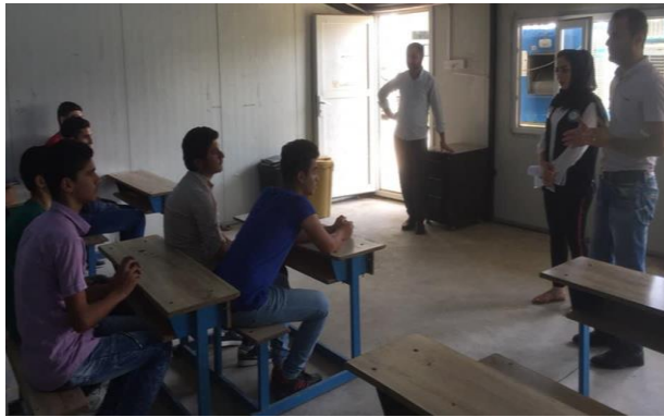
Catch up classes for the Syrian refugees