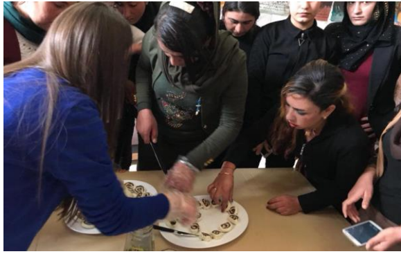
Sweets course for 12 Yazidi women and girls from Sharya camp