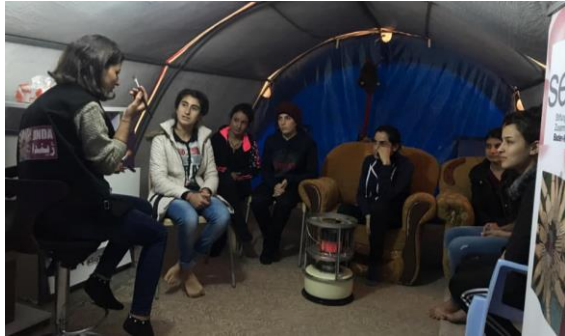
three salon courses for 39 girls from khanki camp