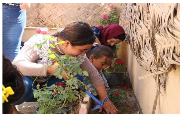
Gardening course for 15 girls and women from kabarto 1&2