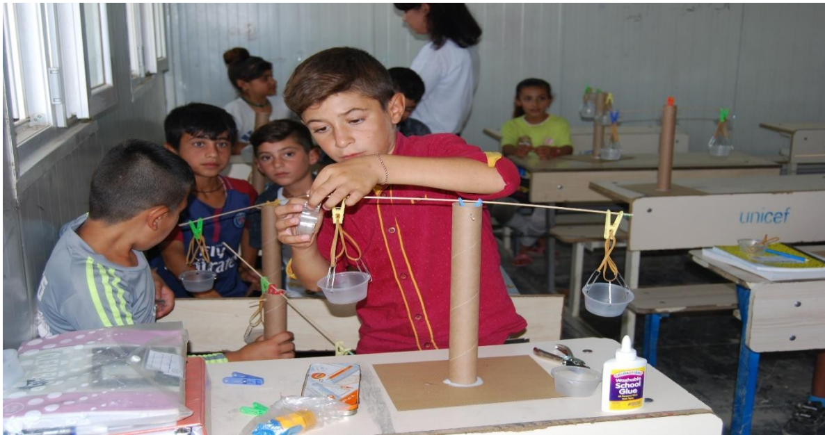
Yazidi IDPs students applying the "Know Atom" program guided by the volunteers in Kabarto 1 primary school

The aim of the project is to teach these students the new methods of science (orally and practically) according to the (KnowAtom) global program. The volunteers from Jinda organization have started applying the global program in Kabarto one and two camps. The project targeted 2300 students in the primary schools.