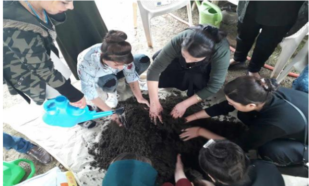
Phase 1: The group of beneficiaries started applying what they have learned orally in the field.