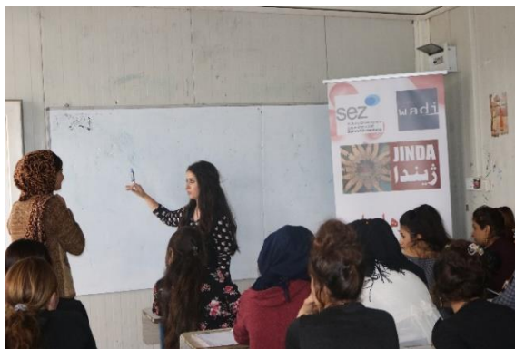
English course for 21 girls from kabarto 2