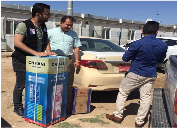
procurement of materials for the target schools