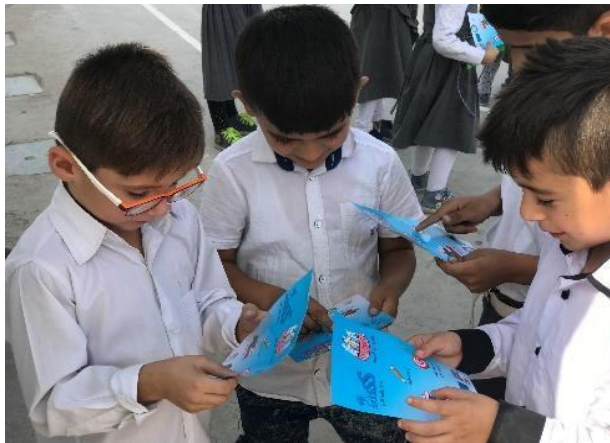
Back to school Campaign