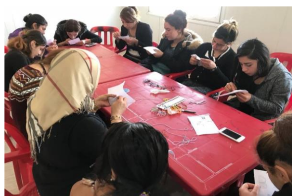
Handicraft course in Kabarto2 camp for fifteen Yazidi displaced girls and women