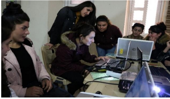
Computer course for 15 girls from kalabadre camp