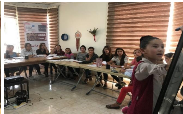
English course for 25 girls and women from Sharya camp