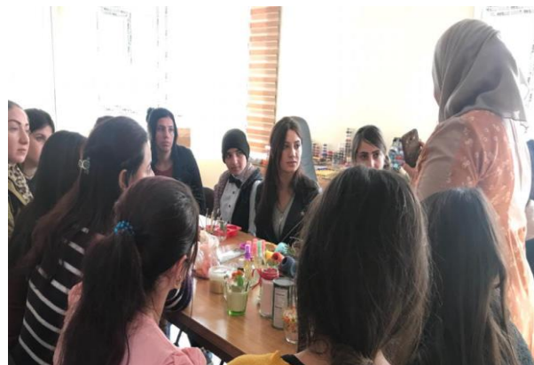
Handicraft course in Jinda for twenty girls from Baadre camp