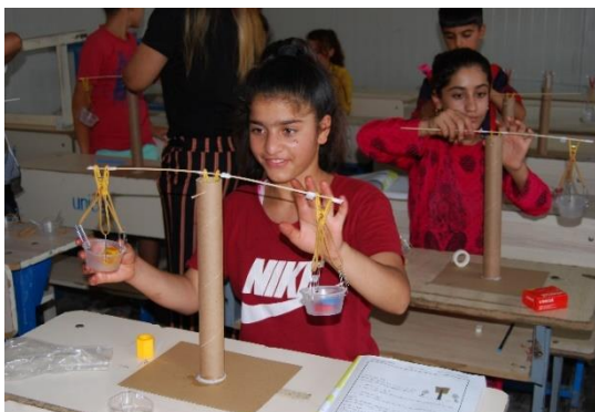
Training the volunteers on applying the program

The project team started implementing the project by meeting with the camp managements of the target camps (Kabarto 2 and kabarto 1), The group of volunteers learned how to deal with students inside the class and were classified into groups each with a leader to mentor and guide on applying the program inside the classes. The project team started introducing the method to the target students in the primary schools.